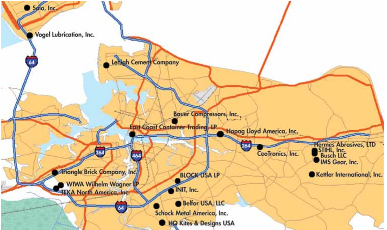
FIGURE 2 GERMAN FIRMS IN HAMPTON ROADS