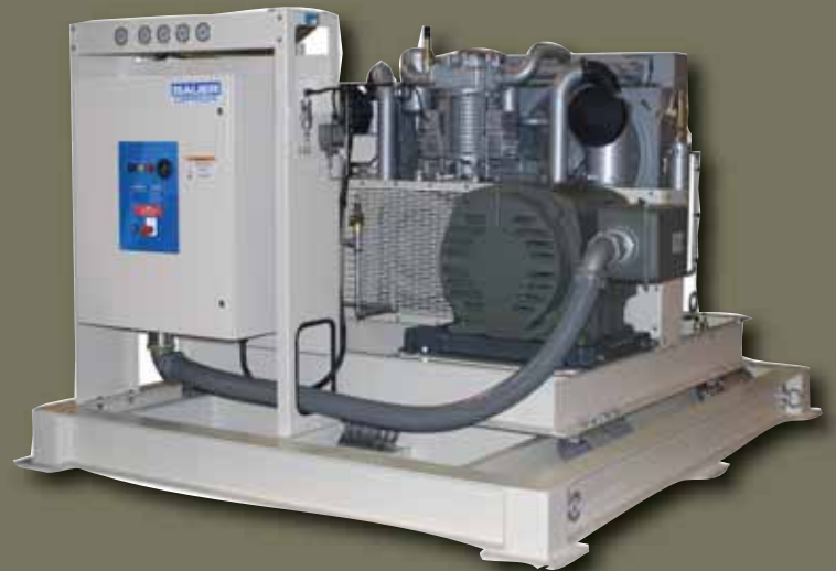
BAUER COMPRESSORS INC.